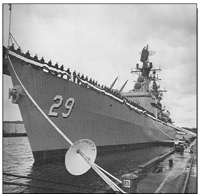
U.S.S. Jouett (DLG29)