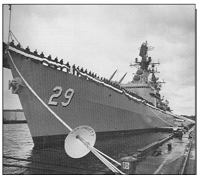
U.S.S. Jouett (DLG29) Commissioning Day