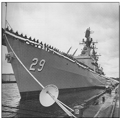
U.S.S. Jouett (DLG29)